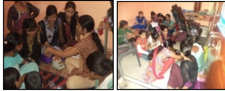
“Beauty culture & Cutting Tailoring Classes”